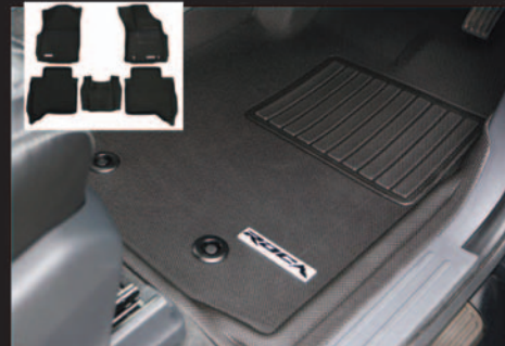
ROC - Moulded Over Mats