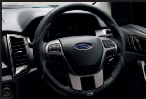
Leather steering wheel