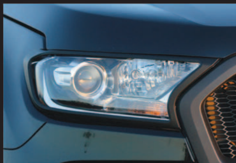
Head light surround