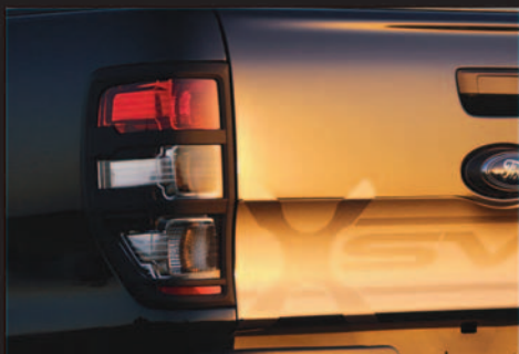
Tail light surround