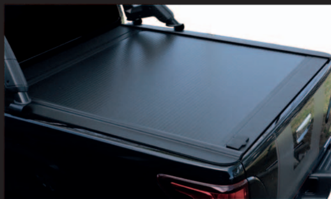
Accessories shown suitable for the Ford Ranger